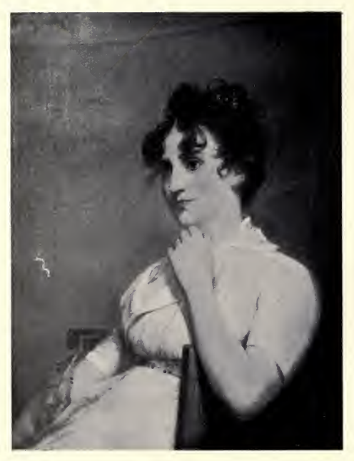
ELEANOR (NELLY) CUSTIS