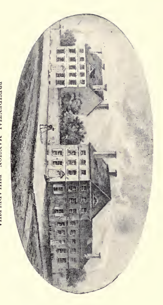
PRESIDENTIAL MANSION, PHILADELPHIA