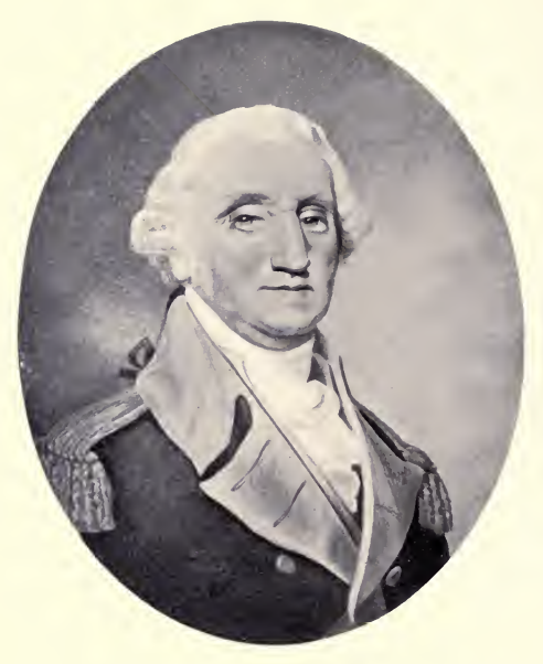
SHARPLESS MINIATURE OF WASHINGTON, 1795