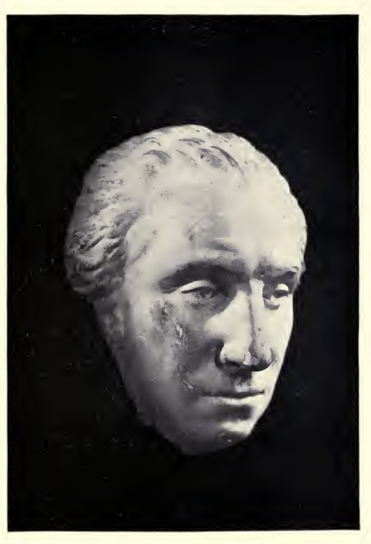
LIFE MASK OF WASHINGTON