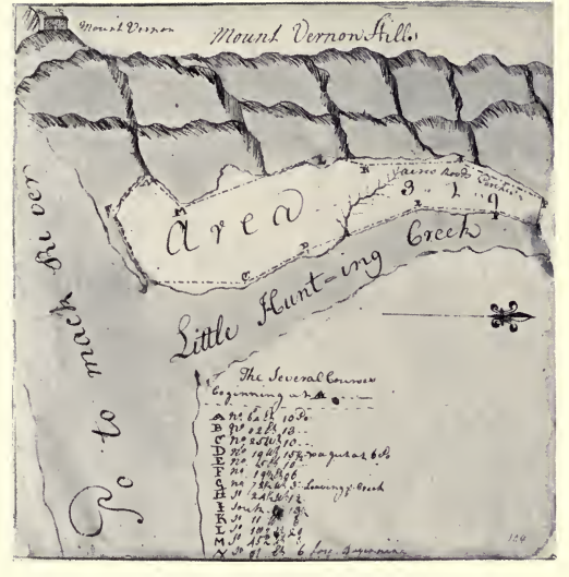
WASHINGTON'S SURVEY OF MOUNT VERNON, CIRCA 1746