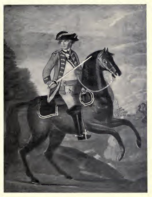
FIRST (FICTITIOUS) ENGRAVED PORTRAIT OF WASHINGTON