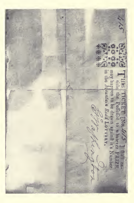
LOTTERY TICKET SIGNED BY WASHINGTON