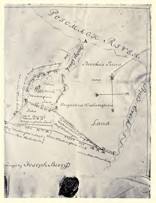
SURVEY OF WASHINGTON'S BIRTHPLACE (WAKEFIELD), 1743